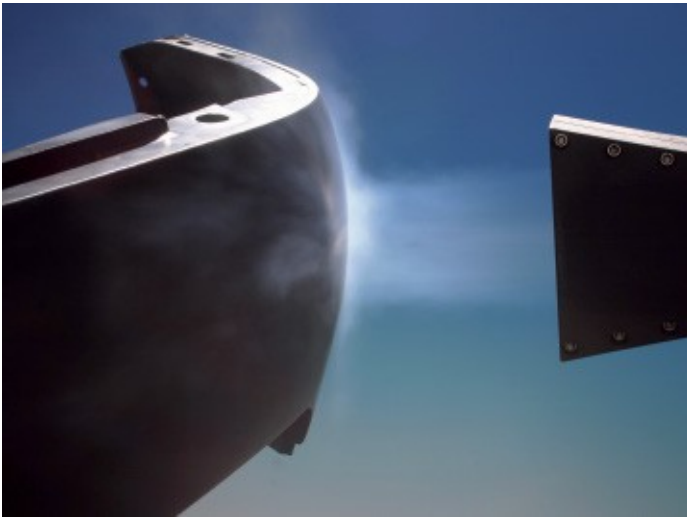
Cleaning of bumper