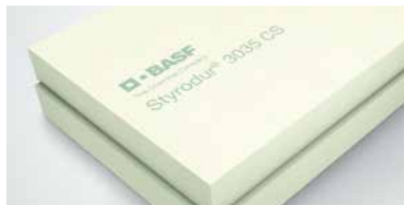
CO 2 -foamed XPS insulation board