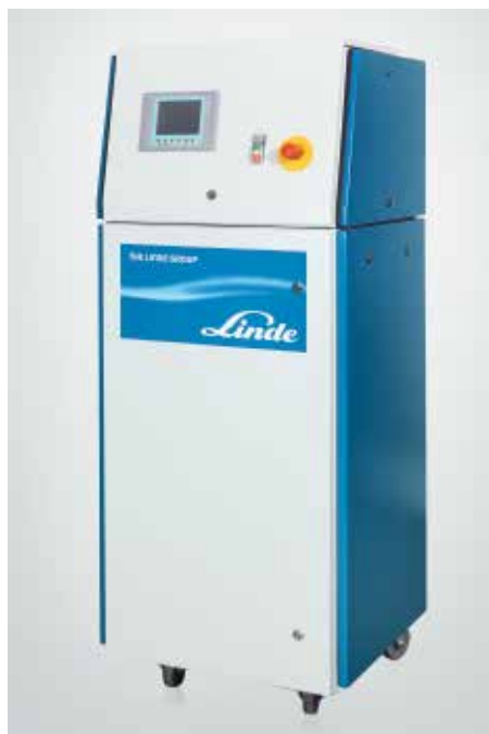
DSD 400 metering unit