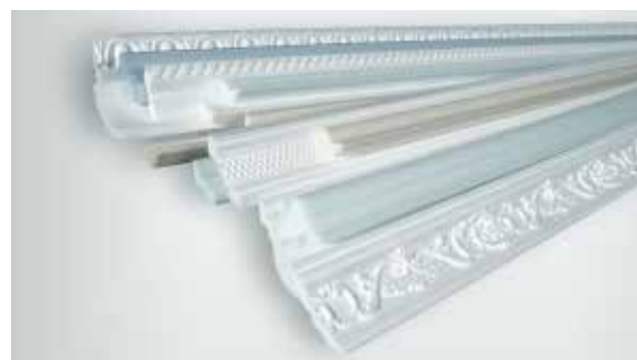
Extruded polystyrene profiles foamed with carbon dioxide

Challenge Carbon dioxide (CO 2 ) as a physical blowing agent for extrusion-foamed plastics like XPS insulation boards is an established, excellent alternative to conventional foaming agents (such as HCFCs, HFCs or hydrocarbons). It offers performance, cost, environmental and climate mitigation benefits.