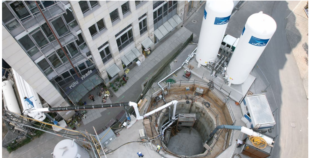
City tunnel Leipzig – soil freezing

Challenge During tunnelling operations, unstable soil and loose sediment can pose a problem. The challenge lies in stabilising the ground so it will not collapse during excavation work and to ensure that progress will not be hampered by water ingress. One way of achieving this is by freezing critical areas with liquid nitrogen (LIN). This forms a frozen wall around the excavation work, increasing the static load-bearing capacity and the impermeability.